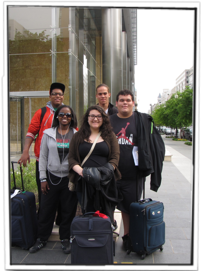
IHTD participants travel from Chicago to DC

Thank you for your work to help build a better U.S. for all of us! We hope to see you in Washington, DC!